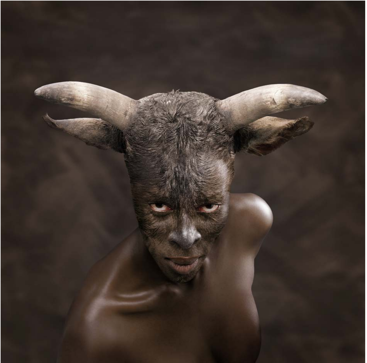
Nandipha Mntambo , Europa , 2008. Archival ink on cotton rag paper; image: 100 x 100 cm, paper: 112 x 112 cm. Edition of 5 + 2AP. Photographic composite: Tony Meintjes. © Nandipha Mntambo, courtesy Stevenson, Cape Town and Johannesburg