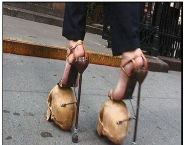
Steven Cohen, Golgotha , details of skull stilettoes, 2007–9.

Single-channel HD video, 20 min 8 sec.