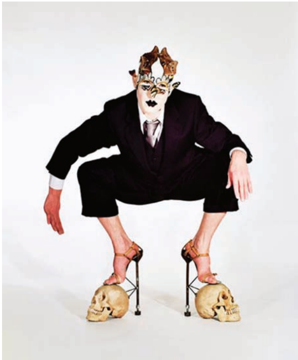
Steven Cohen, Golgotha , 2007–9.

Single-channel HD video, 20 min 8 sec. Edition of 5 + 2AP.